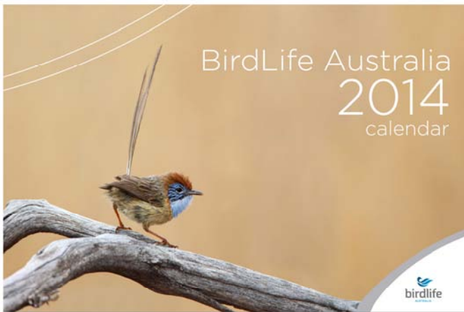
Showcasing the work of our conservation projects across the nation, the 2014 BirdLife Australia calendar brings you twelve stunning photographs of some of our most threatened birds—all species which BirdLife Australia is working hard to protect.

At just $14.95 including postage and handling, it's the perfect gift for family and friends this Christmas, with all profits going to our conservation work across the country.