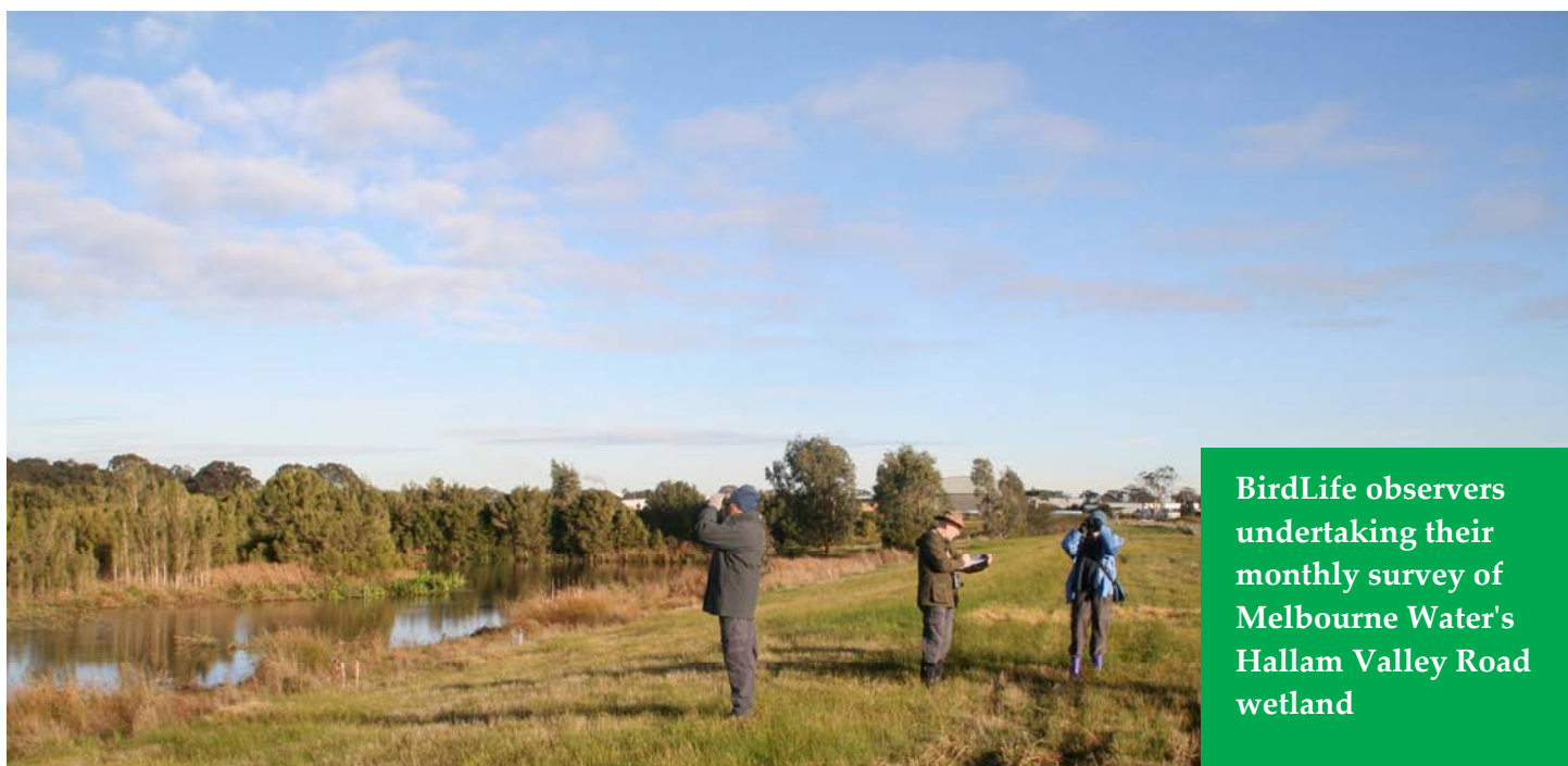
BirdLife observers undertaking their monthly survey of Melbourne Water's Hallam Valley Road wetland

Graeme Hosken Birdlife Melbourne DCS Recorder.