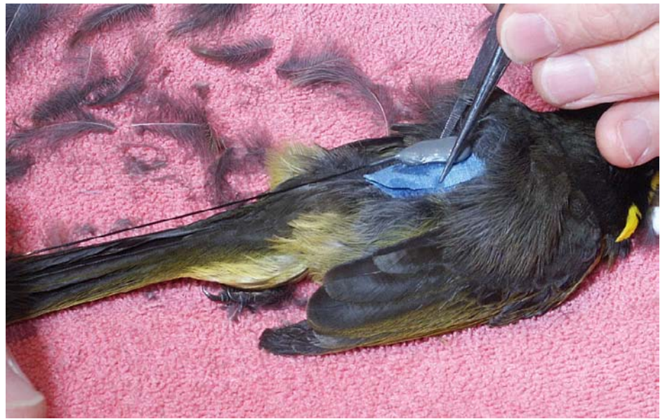
Left: Helmeted Honeyeater, captive-bred and released, Yellingbo May 2009. Above: Radio-transmitter being attached to sedated bird by veterinarians. Below: Release aviary at Bunyip State Park.