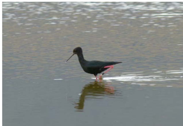
New Zealand's critically endangered Black Stilt (Kaki), the subject of Bill Ramsay's Members Topic at the Balwyn July Meeting.

Latham's Snipe was only recorded at two sites this period: Waterford Wetlands , August (5) and September (28), and Troups Ck , September (1). Australian Reedwarblers returned to South Golf Links Rd in July and were also present in August, no survey in September. All other sites recorded this species in September with the exception of Waterford Wetlands and Hallam Valley Rd . Australasian Bittern , an elusive species, was twice recorded at Troups